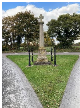
Bronington War Memorial